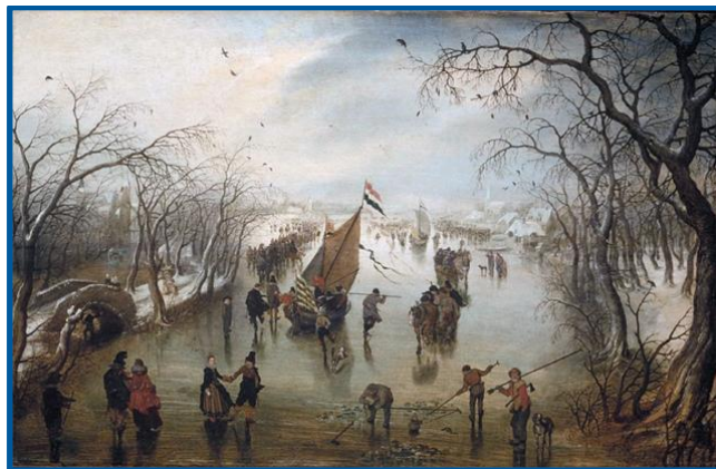
Fig. 2: van der Venne, Winter