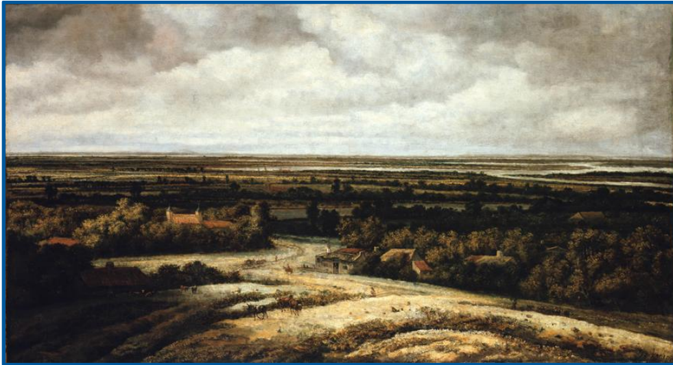
Fig. 10: Ph. Koninck, "An Extensive Dutch Landscape", Berlin ( click to enlarge )

When commenting on these cloud bases in de Koninck's paintings (e.g. " Landscape in Holland " c.1665 , Hunterian Museum & Art Gallery collections, Glasgow ) another meteorological misunderstanding leads to a misinterpretation of the sky: de Koninck "typically shows (.) a splendid undulating mass of clouds whose bases rise and sink gracefully, if impossibly." In fact de Koninck shows distinct cloud bases which are meteorologically correct (Fig. 10). If the view is at about 90° towards rows of cumulus clouds this is a common aspect of the sky. There is no "graceful but impossible rising and sinking", but there is a correct depiction of organized cumulus convection (Fig. 11).