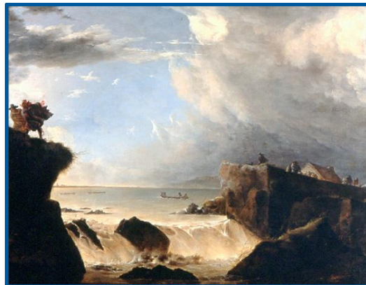
Fig. 4: Asselijn, Muiderdijk

All paintings by kind permission of the Painting Gallery Berlin SMB, (click on the pictures to enlarge)