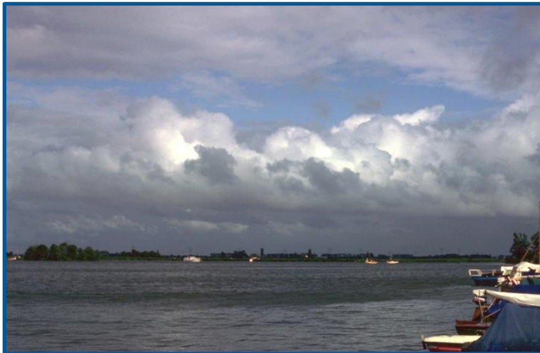
Fig. 6: Cumulus clouds with their cloud bases ( click to enlarge )

This brings us to a third misunderstanding. With another painting of Salomon van Ruysdael (" River View of Nijmegen with the Valkhof ", Fine Arts Museums of San Francisco, 1648 ), Walsh and Siscoe underline their argument against stratiform and cumuliform clouds together in one picture: " Van Ruysdael shows flat layers, or stratus clouds, attached to puffy heaps, or cumulus clouds – an attachment that defies meteorology and thermodynamics. " (Walsh, p. 100) However, this is not true: what we see in this painting is the artist's view of cumulus clouds and their cloud bases. 4 And there is no stratus cloud at all in the whole picture. Van Ruysdael painted this picture in 1648, his earlier works had already shown his capacity as an accurate observer and depicter of clouds (Fig. 5) and there is no reason why he should incorporate a high level cirrus with virga into low level cumuli. There is another painting by S. van Ruysdael (" A View of Rhenen seen from the West ", 1648, National Gallery, London ) in which we find again such "trailing" lines which is nothing else but an artistic reproduction of cumulus cloud bases.