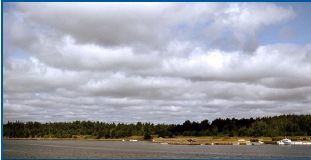
Fig. 11: Cumulus in rows (Cu med rad), photo: F.Ossing ( click to enlarge )