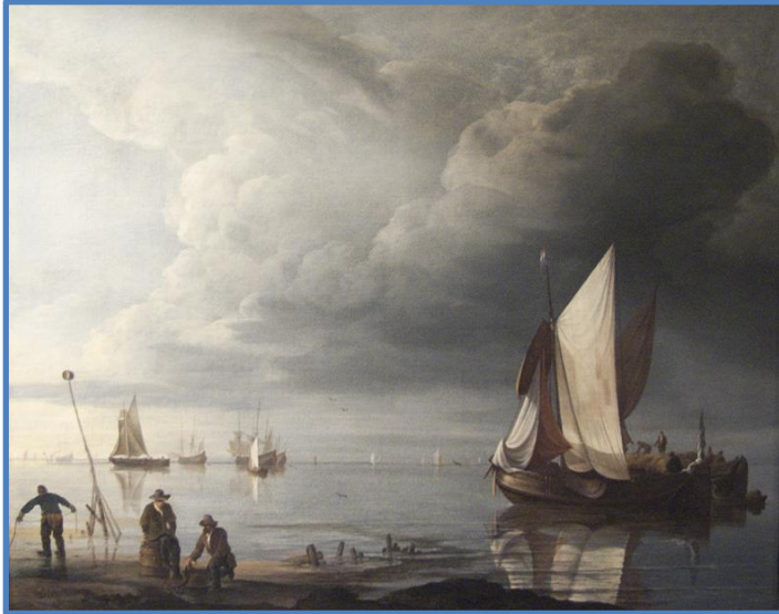
Fig. 12: Hendrik Dubbels, "Shipping in a Calm", canvas, 52 x 66,1 cm, signed: Dubbels, c. 1670, London, Collection Inder Rieden ( click to enlarge )

closer view at the painting, however, shows that the cloud is a common cumulus congestus with midlevel ( altocumulus ) cloud above it, and not a thunderstorm. Secondly, thunderstorm clouds do exist in many Dutch paintings: J. van Goyen introduces lightning into Dutch landscape painting (Giltaji/Kelch 1996, p. 164), A. Cuyp shows " The Maas at Dordrecht in a Storm " (about 1645-50, National Gallery London) with lightning of a thunderstorm, also J. van Ruisdael and H. Staets painted flashes of lightning, and Dubbels (Collection Inder Rieden) shows a perfect thunderstorm in a warm air mass (Fig. 12).