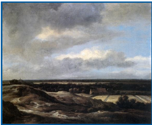
Fig. 1: Ruisdael, Haarlempje

The most common cloud type is stratocumulus (WMO, 1956, 1987a). 2 Actually there are a lot of paintings that show stratocumulus clouds, e.g. Jacob van Ruisdael's smaller "Haarlempje" of the Painting Gallery in Berlin (c. 1670, Fig.1) which represents very normal weather in Holland. Indeed a large number of clouds belonging to different weather situations can be found in the galleries giving an overview of the types of weather prevailing in Europe and during the Little Ice Age (Ossing 2001). We find winter scenes with a layer of stratus cloud breaking up: typical for winter mornings in a high pressure situation (van der Venne, Fig. 2), late summer days with cold air invading Europe (Santvoort, Fig. 3), cumulonimbus clouds at the passage of a cold front in early spring (Asselijn, Muiderdijk, Fig. 4), and so on.