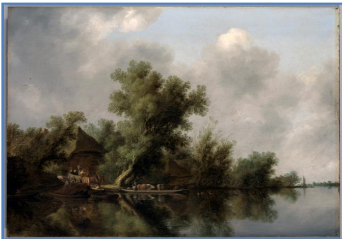
Fig. 5: Salomon van Ruysdael, "River Landscape with a Ferry", 1630/35, by kind permission of the Alte Pinakothek Munich, Inv.Nr. 161. The clouds are cumuli that develop from stratus (Cu hum st-mutatus) ( click to enlarge )

There are several assumptions in this statement that do not stand closer meteorological examination. First, it is wrong to attribute stratiform clouds only to stable weather and convective clouds only to unstable atmospheric conditions. Cumulus clouds can be found in high pressure zones and stratus clouds can be found in lows, the extrem case is a thunderstorm cloud (cumulonimbus) embedded in a heavy nimbostratus deck, still today a pilot's nightmare. That is: stratiform and cumuliform types of clouds can co-exist, even in close vicinity.