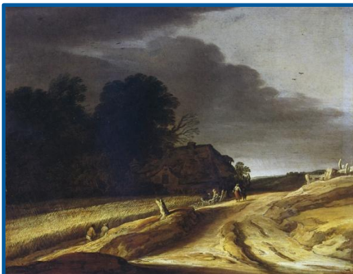
Fig. 3: Santvoort, Land and Farm