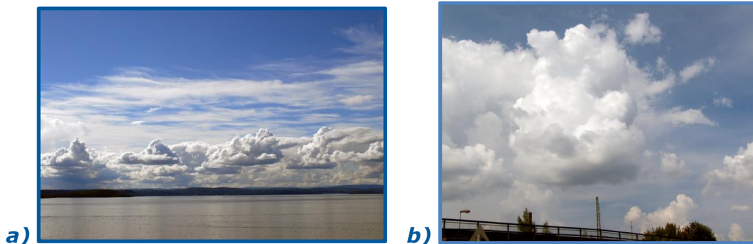
Fig. 8: Cumuli with a sharp (a) and a diffuse (b) cloud base (click on the pictures to enlarge)

Cumulus clouds are ubiquitous in Dutch paintings. Walsh states that in particular the flat cumulus cloud bases are not depicted and that the clouds are often painted distortedly for compositional reasons of the painting (Walsh p.100ff). It is right that a cumulus (or convective) cloud develops when a parcel of air rises. Due to cooling during the uplift condensation takes place at a certain height, the so-called condensation level. But it is wrong to think that this always should create a sharp flat cloud base. Depending on the type and the age of an air mass in which cumuli form the condensation level can be a layer of condensation rather than a distinct level . 5 So not every cumulus cloud has a sharply defined cloud base and often a diffuse cloud base can be observed in nature (Fig. 8a,b).